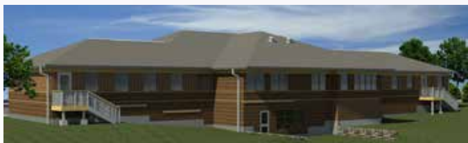
Wikwemikong Shelter for Victims of Violence to be completed December 2018 (back view)