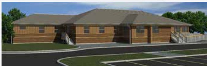
Wikwemikong Shelter for Victims of Violence to be completed December 2018 (front view)

"Nookamisnaang" will be a safe, protective Shelter Facility for women with children, men with children, women, men, youth, families that also offers therapeutic services, for victims of a current volatile living environment, in keeping with the Wikwemikong Health Centre's vision for the wholistic well being of the community.